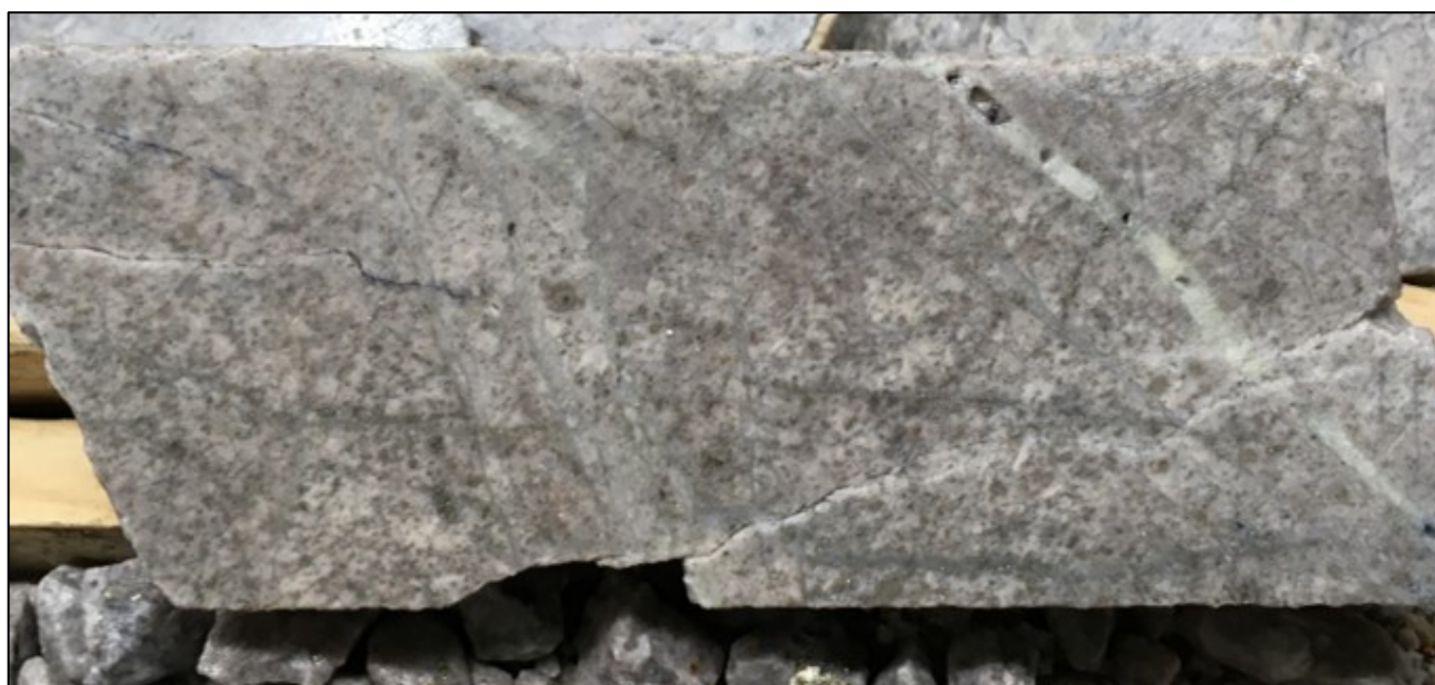
Fig. 3: NQ core (47.6mm diameter) from 203-204m downhole in DO-20-283; that interval assayed 5.25 g/t Au. Both disseminated and veinlet pyrite are present in bleached syenite. Photo is of a selected interval and is not necessarily representative of all mineralization hosted on the property.

The new assay results from DO-20-280 and DO-20-283 support the presence of multiple mineralized gold zones within the top 50-250 metres vertically in the western part of the Porphyry Zone, above or at the current base of conceptual pits that are relatively shallow in this area, and provide support for near-surface upside in this relatively sparsely drilled area on the north side of the Porphyry Zone.