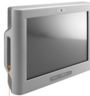
Compact CD-ROM drive