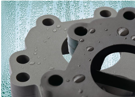
Fig. 3: Aluminium-cast part: PFA-PFA coating (left) and HART-COAT ® -PFA coating (right) The water-repellent property of the coatings is easily recognizable.

traps etc. Figure 3 shows that the coating systems possess very good hydrophobic properties as well.