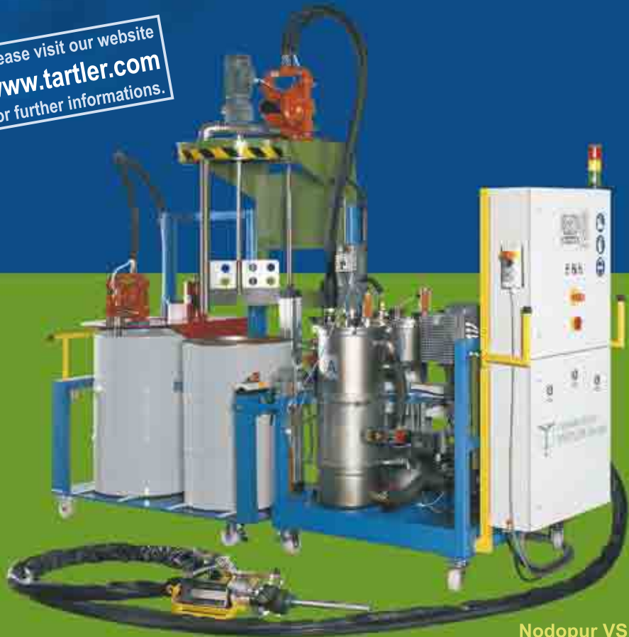
Nodopur VS AR

Please visit our website www.tartler.com for further informations.