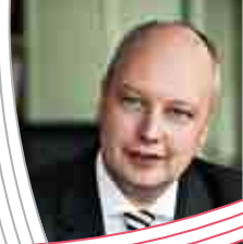
Jörg Bode, Minister for Economics, Labour and Transport of Niedersachsen

I wish all participants a successful run of the convention, interesting new contacts and a pleasant stay in Stade.